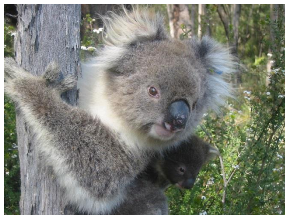
Figure 3 Koala

Join a local conservation group! Many groups work on increasing and improving habitats for koalas. Koalas and other wildlife need continuous habitat to live and breed successfully.