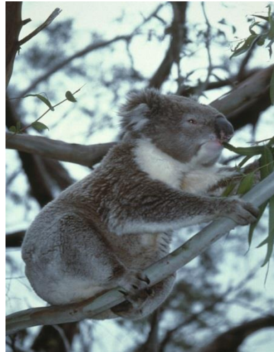
Figure 1. Koala

Koalas in Victoria are generally larger than those in Queensland, and their fur is thicker.